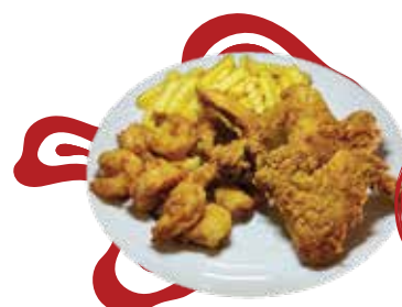
TILAPIA & TENDERS