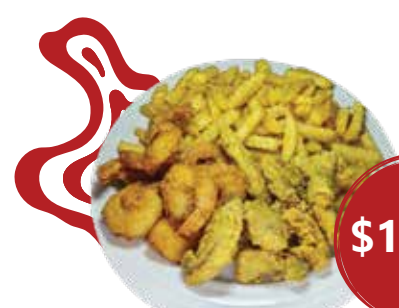
WINGS & SCALLOPS